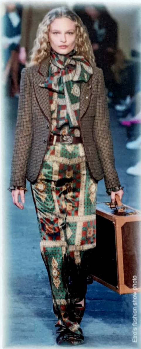
Etro's fashion show photo