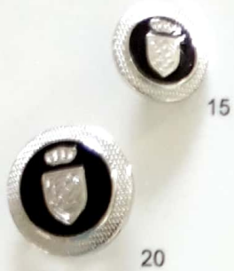
Nickel F. + Black 9