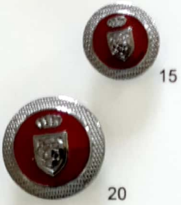
Gun Metal + 341 14