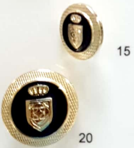
Light Gold + 189 6