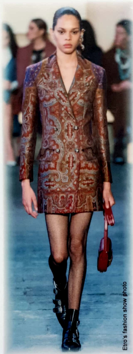
Etro's fashion show photo