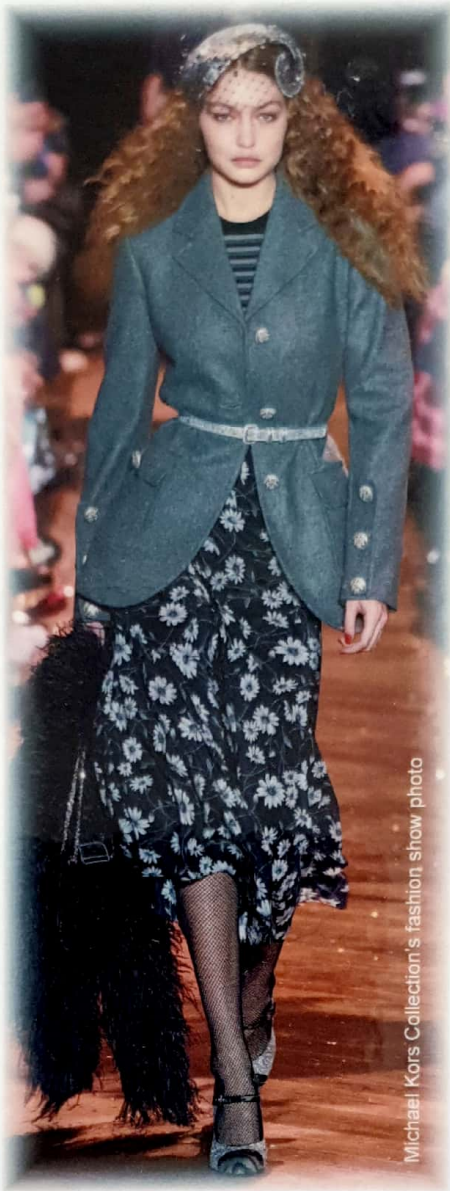
Michael Kors Collection's fashion show photo