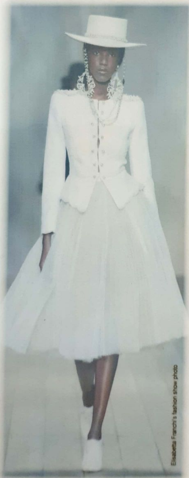
Elisabeta Franchi's fashion show photo