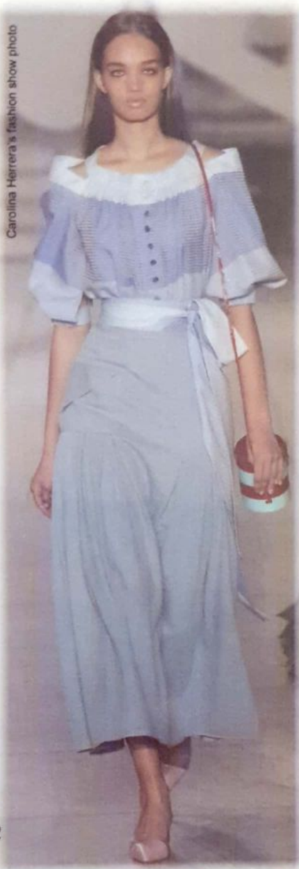
Carolina Herrera's fashion show photo