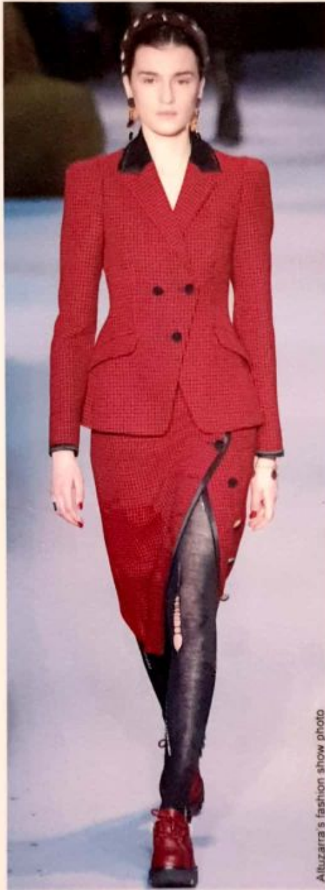
Altuzarra's fashion show photo